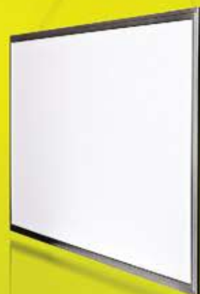
MPLS 02 45 W

Embeddable Installation: The panel is to be put into the cut out size hole of the ceiling.